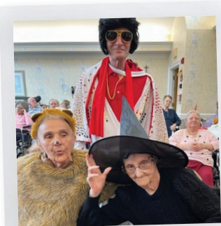
Halloween with Elvis

Our Assisted Living facility, the Saab Residence held their first-ever Trick-or-Treat event this year and it was a spooky success! Residents thoroughly enjoyed handing out candy and seeing all the creative costumes, as family members and staff's little ones joined us for Halloween fun. Residents and staff at D'Youville Senior care were "all shook up" with a visit from Elvis. Everyone got into the spirit dressed in fun costumes, enjoying entertainment and treats! The smiles, laughter, and joy shared made it a truly memorable experience for everyone involved!